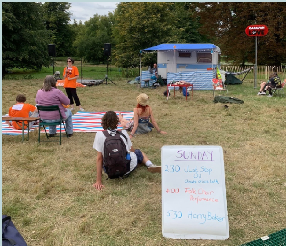
Off-programme stage.