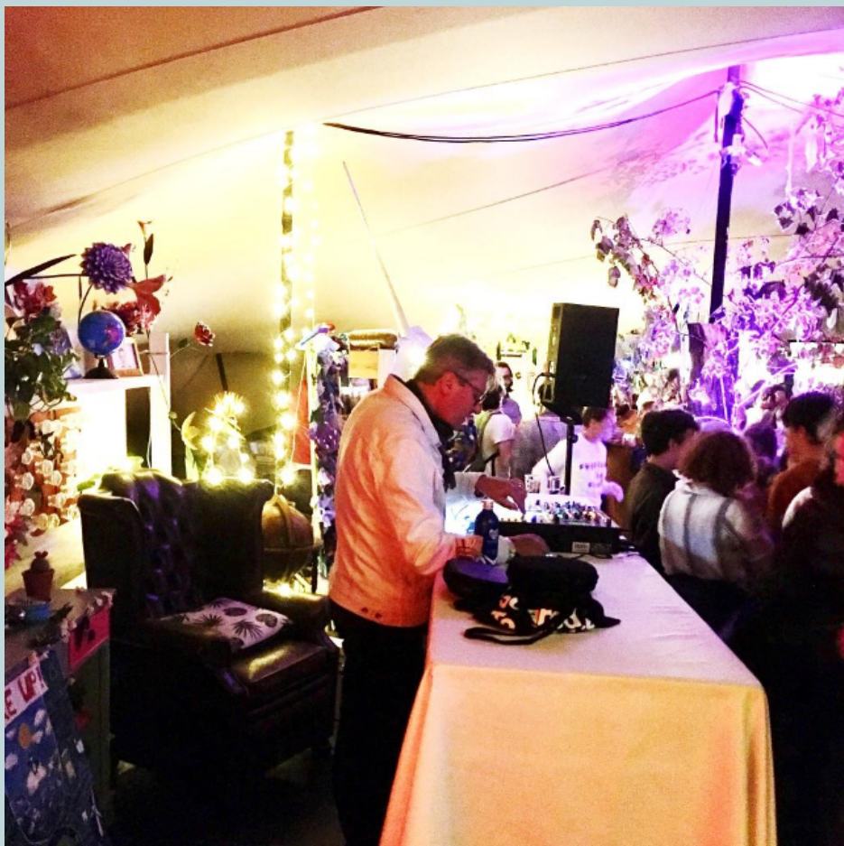
It looks like he's doing his reading... And with the crowd not really paying him any attention which is so funny. (GB1, photographing poet laureate Simon Armitage's DJ set)

Many people commented on the 'blurring of distinctions' between artists and audiences that took place outside the scheduled gigs. One Greenbelter, for instance, was surprised to meet a band in a queue: "I just thought that was weird because I wasn't expecting them to be performers, I just thought they were like me, but I guess it shows how kind of...mixed everything is" (GB6). While other festivals discouraged contact with musicians, she felt, at Greenbelt "there's no kind of them versus us". A Greenbelt venue felt "comfortable" and "homely" to another attender, because while one band were warming up, "the people who'd played before them would sort of mill around in the crowd, going to watch and chat to people and stuff" (GB17).